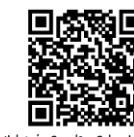
Children's Sunday School Teacher Sign Up