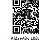
KidzWay Leader or Assistant Sign Up