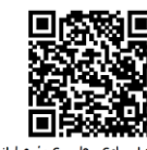
Children's Sunday School Teacher Sign Up