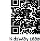
KidzWay Leader or Assistant Sign Up