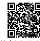
Children's Sunday School Teacher Sign up