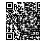
Children's Message Sign up

Volunteers are needed! If you feel called to help out with Children's Ministry, sign up at the QR codes below or contact Mrs. Laura!