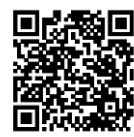
KidzWay Leader or Assistant Sign up