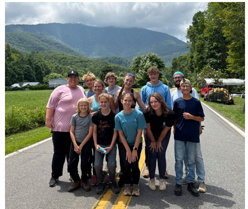
ABOVE: LUMC's Youth Mission Team serving in Marion, NC.

For Youth Sunday, the LUMC Youth will be taking over both services, from reading scripture to serving Communion. Join us for this special service to see our youth in action and hear about their mission trip to Marion, NC where they supported Hurricane Helene cleanup efforts. It is also Blessing of the Bookbags Sunday – all students, teachers & support staff are invited to bring their school bags for a special blessing as we prepare for the new school year.