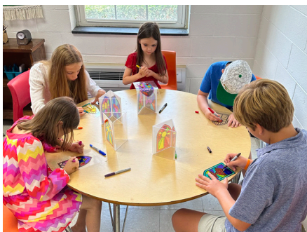
ABOVE: LUMC's children's ministry prepares for the Sept. 7th Celebration by creating centerpieces.