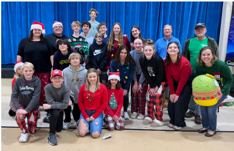
PICTURED ABOVE - Youth Christmas Party: Youth and Adult Volunteers had a wonderful time sharing a potluck meal, swapping gifts with a White Elephant gift exchange, and playing games to bid on & win prizes in Christmas Bag Bonanza.