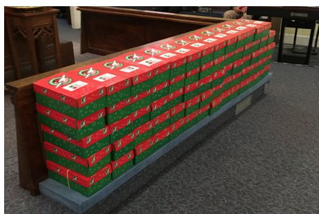
The packed shoeboxes were placed on the altar to be prayed over before being mailed.

We ask for your continued support in 2024 through your prayers, your gifts, and your service. To support this outreach ministry you can make a donation by putting "Alapaca Shoebox" on the memo line or by placing donated items on the collection cart in the main hallway. Contact Trudy Huffstetler or Vicki Boylston with any questions.