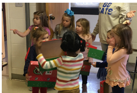
LUM Preschool helping pack shoeboxes.